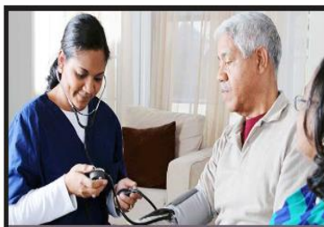
Maternity & Child Welfare Centre