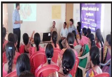
Anganwadi Training Centres