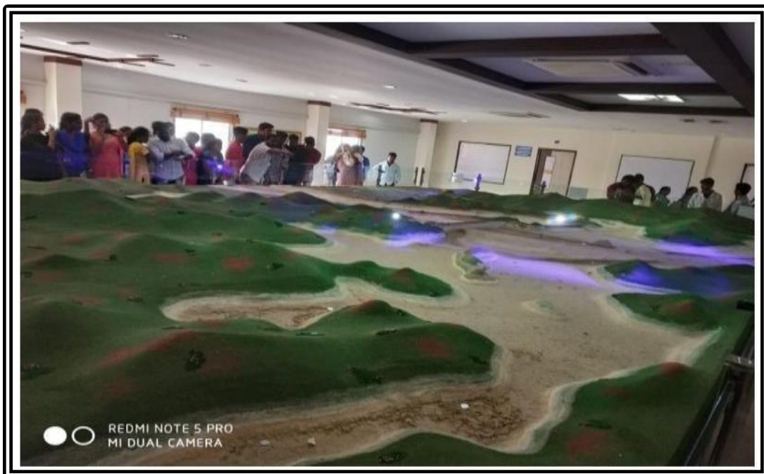
Polavaram Project Design