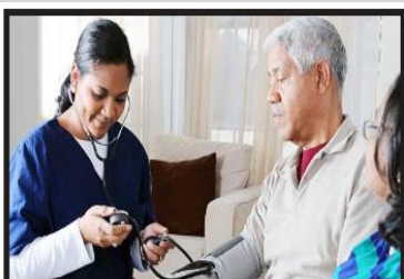
Maternity & Child Welfare Centre