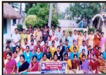
Awareness Programmes on Women Issues