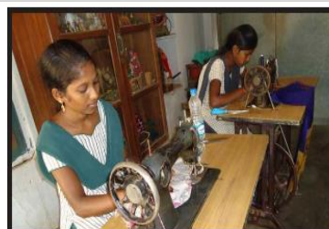
Training In Sewing Centre