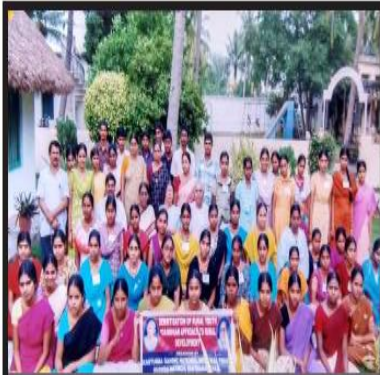
Awareness Programmes on Women Issues