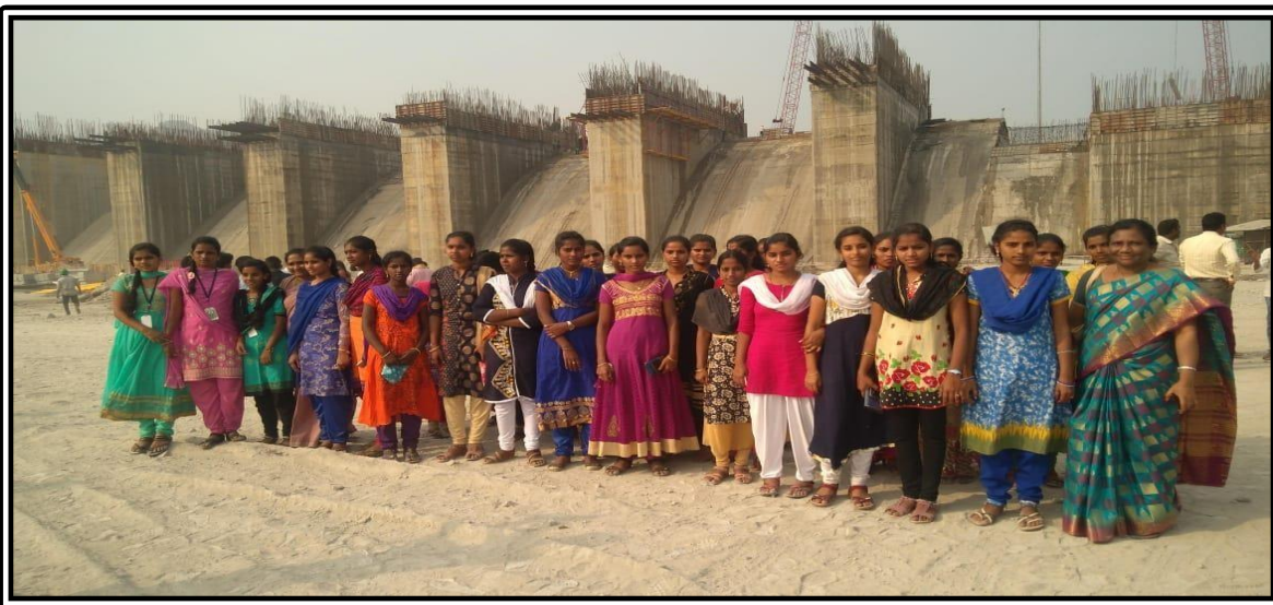
Students and Staff in front of Polavaram Project Spill Way