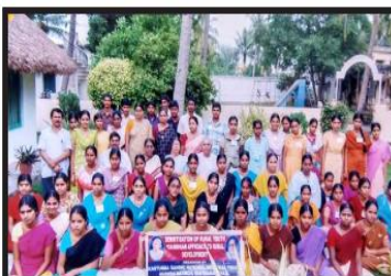
Awareness Programmes on Women Issues