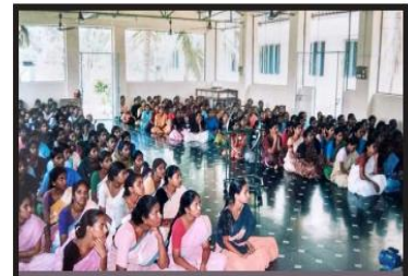
Short stay Home for Women Destitutes