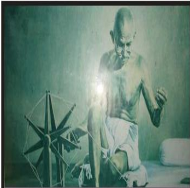
Community Base Service Activities