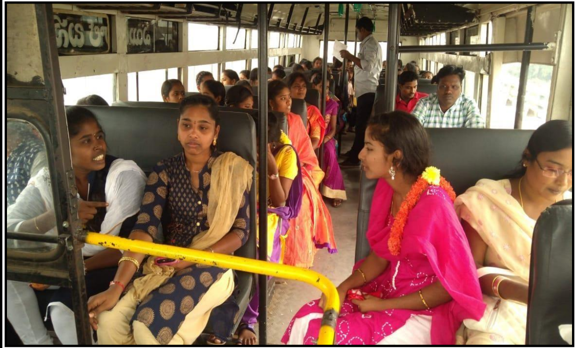
Journey to Polavaram Project by buses