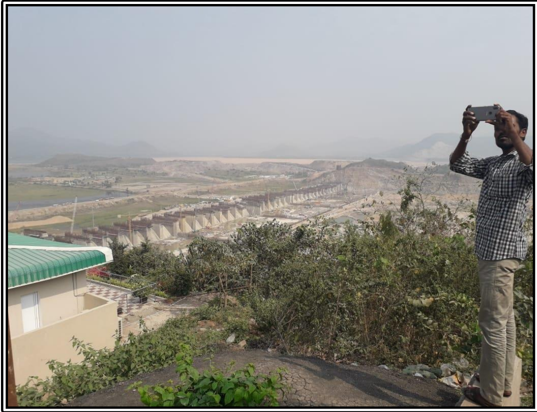
Polavaram Project Hill View