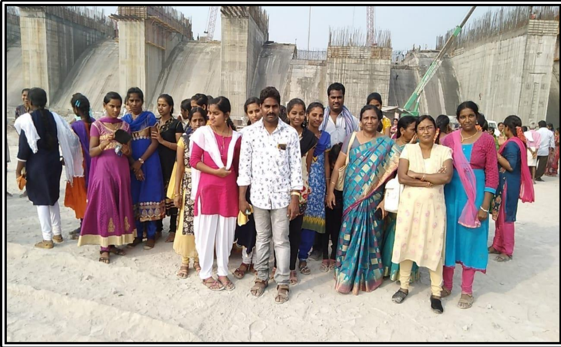
Students and Staff at Polavaram Pylon