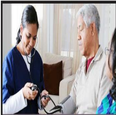
Maternity & Child Welfare Centre