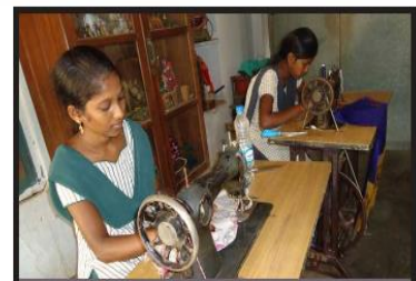
Training In Sewing Centre