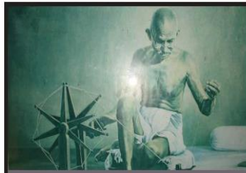
Community Base Service Activities