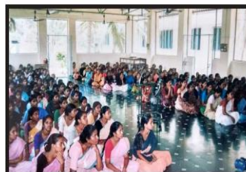
Short stay Home for Women Destitutes