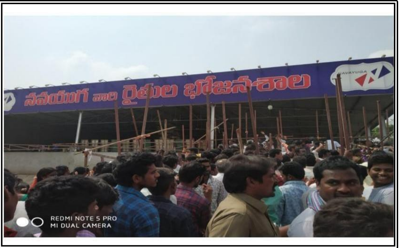
Lunch at Polavaram Project