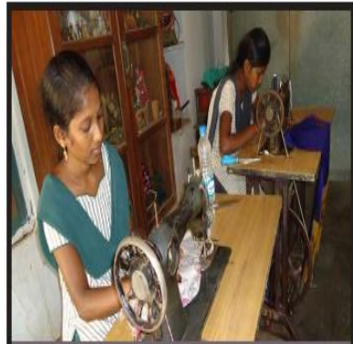
Training In Sewing Centre