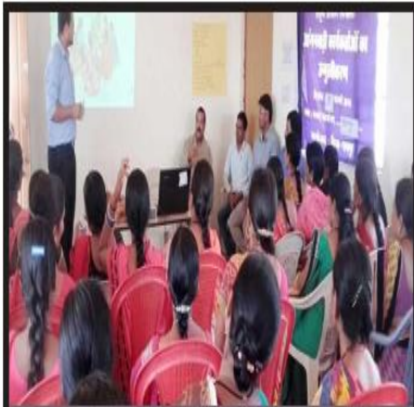
Anganwadi Training Centres