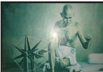
Community Base Service Activities