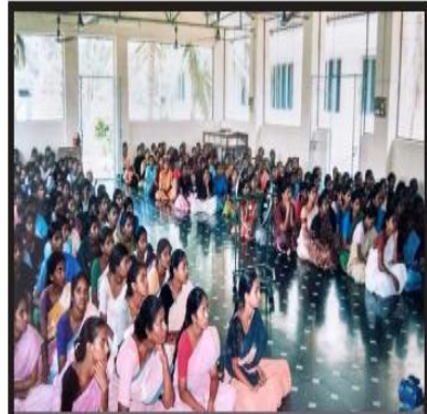
Short stay Home for Women Destitutes