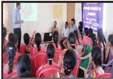
Anganwadi Training Centres